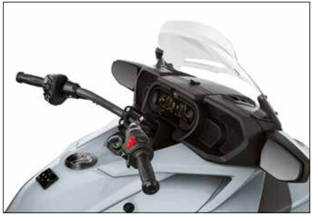
BRP AUDIO PREMIUM Our 6-speaker sound system comes equipped with radio, USB, Bluetooth<sup>†</sup> and 1/8" (3.5 mm) audio inputs so you can listen to your favourite music from any device.

Watertight top case provides 60 L (15 gal) of storage, making it perfect for not leaving anything behind on a long-distance ride.