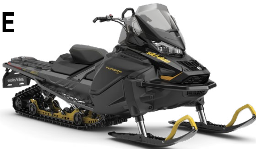
TUNDRA LE 600 EFI SHOWN

Great off-trail and deep snow performance with light-utility capability.